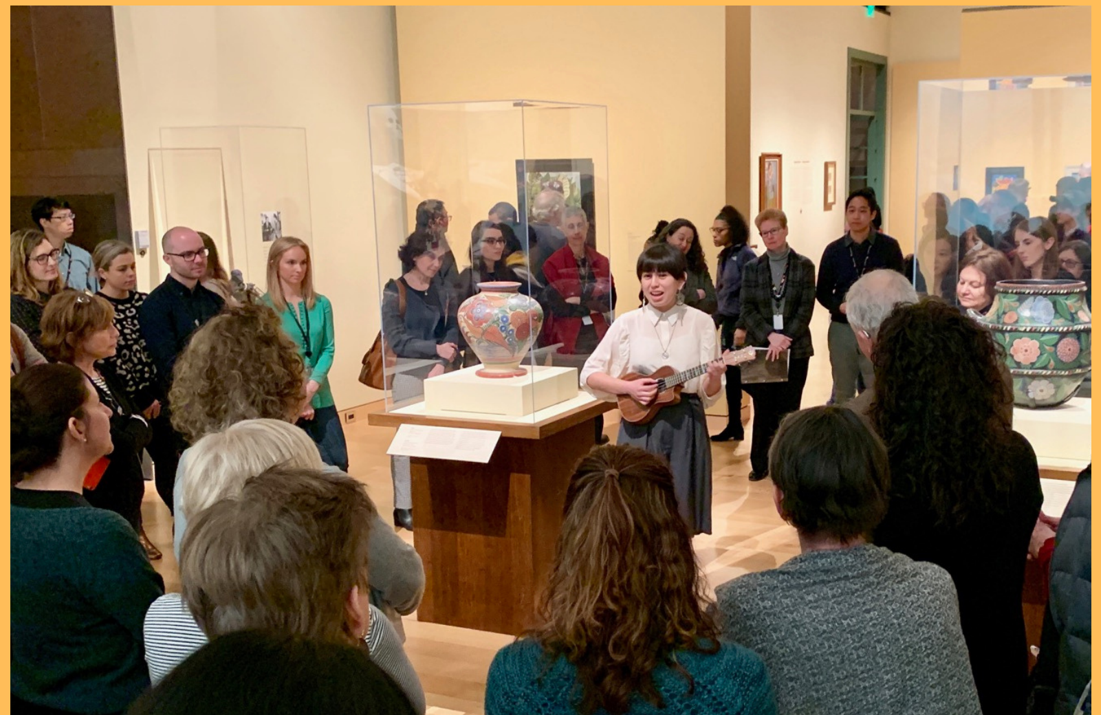
Live at the Museum of Fine Arts Boston on International Women's Day