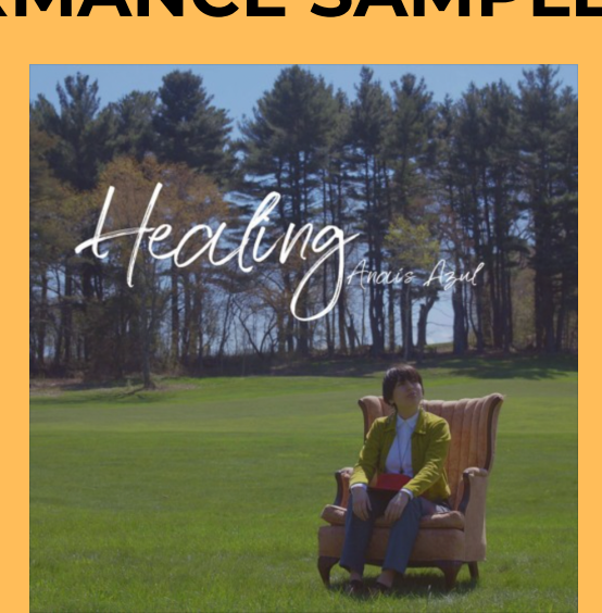
"Healing" - Single