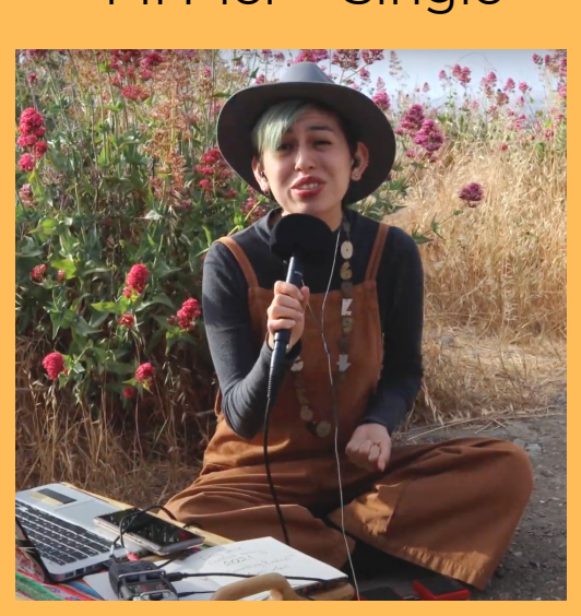
"Something Radical" - LIVE